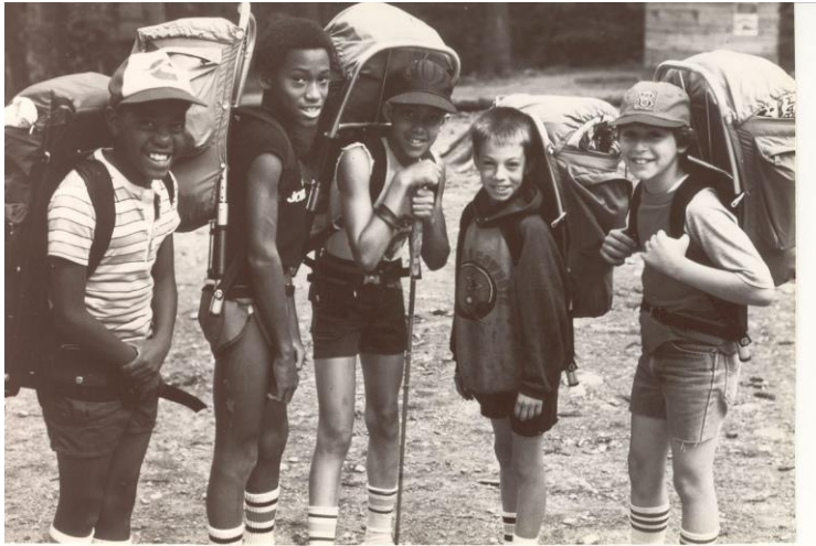
Kids at Camp Hale

individualism where how do I make it on my own? It's how do we make it honor the importance of community and your responsibility to others?