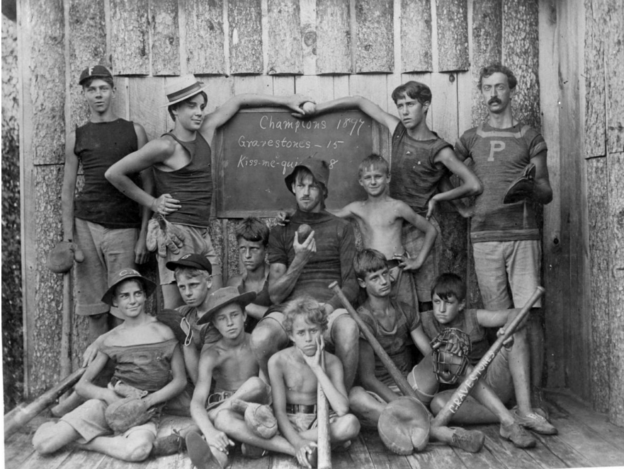
The championship ball club of 1897.