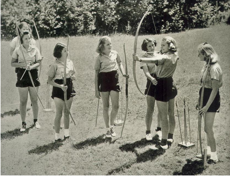
Archery at Camp Ogontz, 1940s