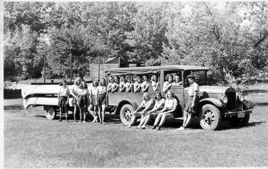
Eagles ready for a canoe trip – c. 1942

And you know one of my favorite kind of characters within this is a guy named Dudley Sargent and Dr. Sargent ran the Hemenway gymnasium at Harvard and he founded Sargent School for Physical Education which was a school designed to teach women to be physical educators that opened in 1881 maybe early 1880s. And you know, at a point in time when it was considered that if women ran, their uterus would fall out right.